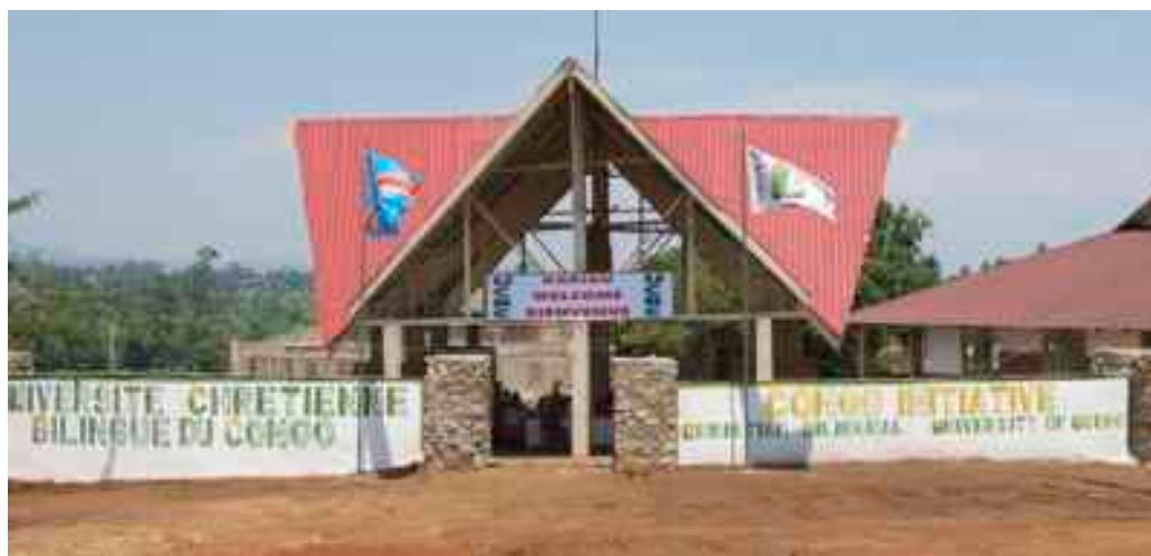
Newly completed entrance to UCBC campus